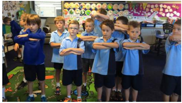
Grade 1 boys practising for the concert!

Religion: The First Christmas, this weeks focus- 'Nativity'