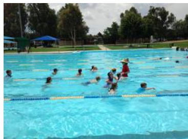
Discovery students enjoying swimming lessons this week