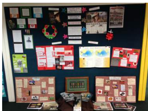
ANZAC displays in Year 5 & 6 Learning Spaces