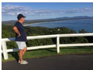
Byron Bay Lighthouse

Those people that do not have access to a computer and printer, please do not hesitate to contact the school office and we can arrange to do this first step for you.