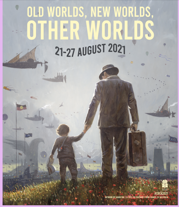
BOOK WEEK is coming!