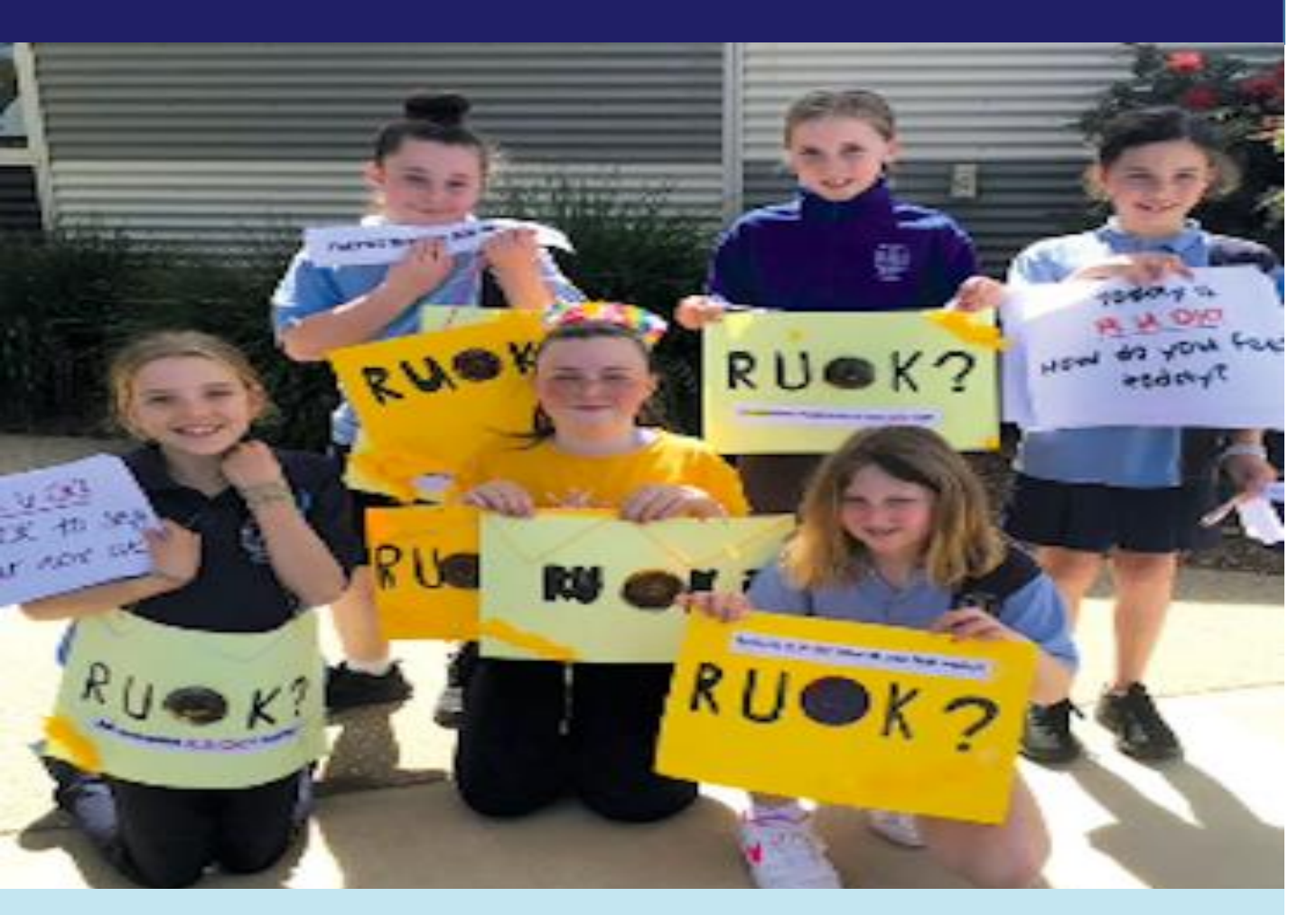
Registered School Number: 401