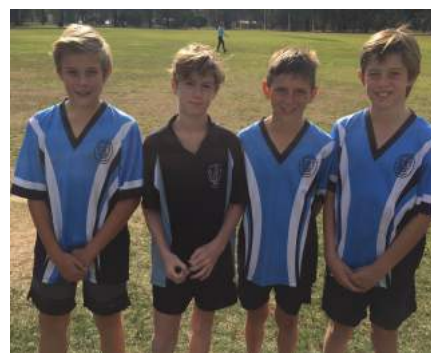
12 Year Boys