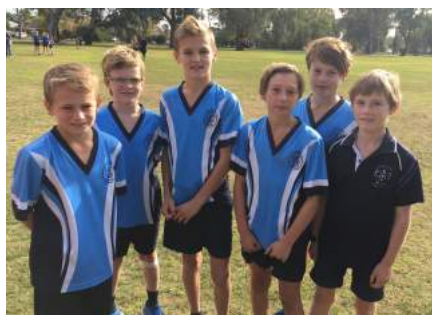
11 Year Boys