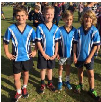
10 Year Boys