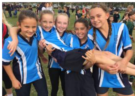
12 Year Girls