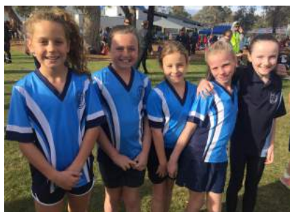
10 Year Girls