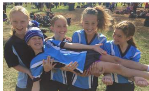
11 Year Girls